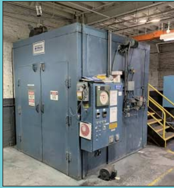
Binks BWN-68-7G Natural Gas Oven