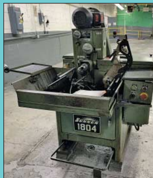
Sunnen MBC-1804 Horizontal Honing Machine