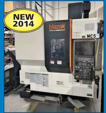
Mazak VCU 500 5X 5-Axis CNC Vertical Machining Center