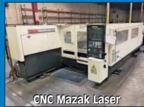
CNC Mazak Laser

Contact Information 2020 Dunlap St. Cincinnati, Ohio 45214 Phone 513-241-9701 Fax 513-241-6760 www.cia-auction.com