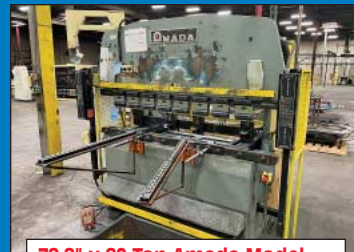
78.8" x 80 Ton Amada Model RC-80S Press Brake