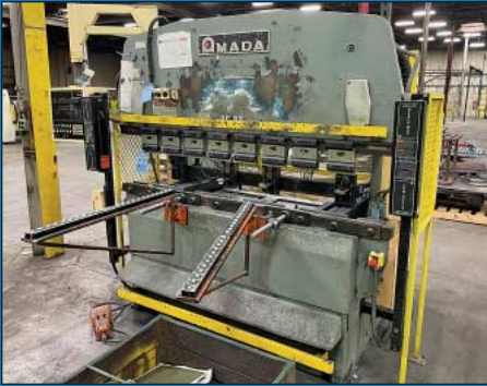
78.8" x 80 Ton Amada Model RG-80S Press Brake