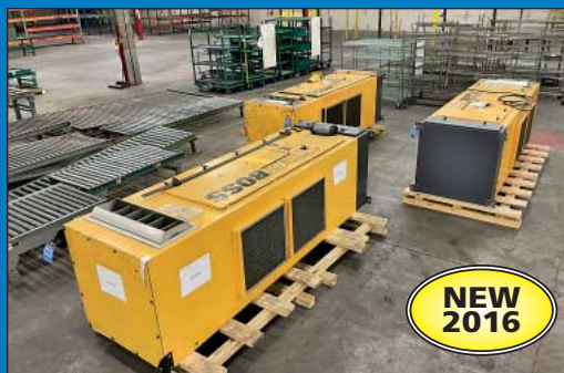
(6) Fume & Dust Collectors by RoboVent, Torit & Vent Boss

Equipment: (5+) Pallets of Misc. Hand Tools, Carts, Roller Conveyor, DE Grinder,