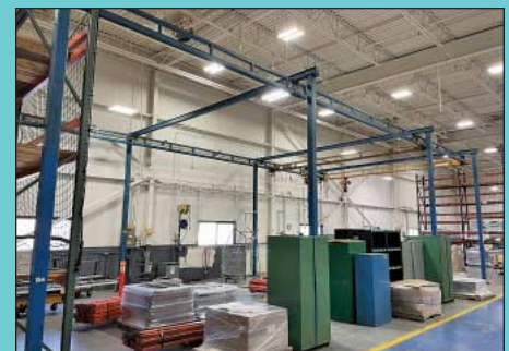
(4) Gorbelt Free Standing Bridge Crane Systems