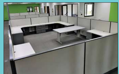
Late Model Office Furniture, Cubicles & Break Room