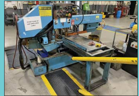
9' x 16" DoAll Model C-916SA Swivel Auto Horizontal Band Saw

Misc. Office & Break Room Items: Office Desks and Tables with Chairs, Cubicle, Conference Room Tables, Nurse's Beds, File Cabinets, Shelving, Mini Refrigerator, Cabinets, Lockers, Tables, Sofa Chairs, Scale, Bench, Tables, Folding Tables, Chairs, Microwaves, Refrigerators, Shelving, Cabinets, Projectors, Projector Screens, Ice Maker, BluRay Player, Microphone Sound System, Etc.