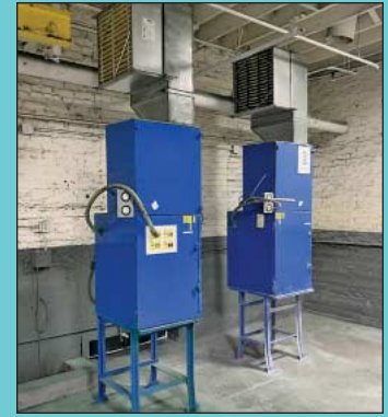
(5) Torit Dust Collectors

Belt Sander, Notcher, Arbor Press, Hydraulic Press, Yellow hinge Racks, 1818 Conduit Bender, Weld Curtains, Barrel Pumps, Hydraulic Pumps, Sump Pumps, Hydraulic Lift Tables, Air Hose Reels, Green Roll Around Baskets, Shop Vacs, Mop Buckets, Floor Fans, Wall Fans, Trash Cans, Electric Motors, Metal & Wire Shelving, Lock Pocket Baskets, Lid Carts, Weld Carts, Plastic Push Carts, Blue Wooden Crate Stands, Green Engineering Work Kiosks, Roll Around Tool Cabinets, (2) Granite Tables, Air & Electric Hoists, Stack Bins, Work Benches, Miscellaneous Maintenance Supplies, 5,000 LB Floor Scale, Pallet Jacks, Strapping Kits, 16 Ton Roller Skate Kit, Bishamon Skidlifts, Guardrail