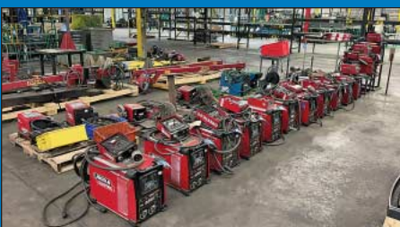
(10+) Lincoln S350 Power Wave Welders with Feeders & Booms