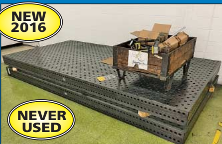
(2) Sigmund Demmler Style Welding Tables