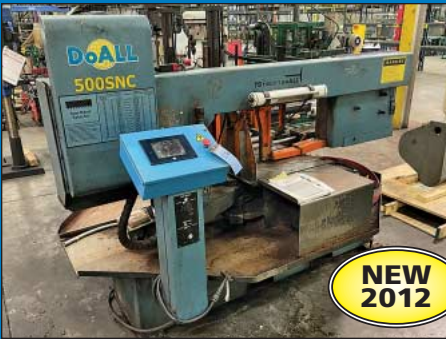
14" x 20" DoAll 500SNS Swivel Auto Horizontal Band Saw