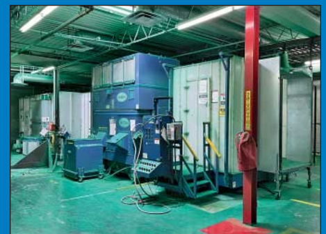
(2) Nordson XL-2002 Surecoat Electrostatic Powder coating Paint Booths