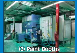
(2) Paint Booths