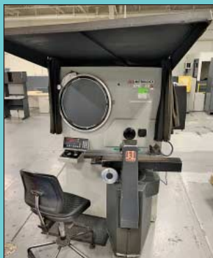
J&L Epic 20 Optical Compactor