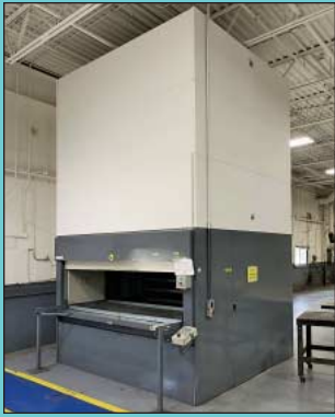
Kardex Titan Vertical Storage System