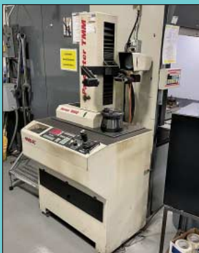
Parlec Series 1000 Tool Presetter TMM