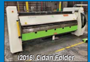
(2016) Cidan Folder