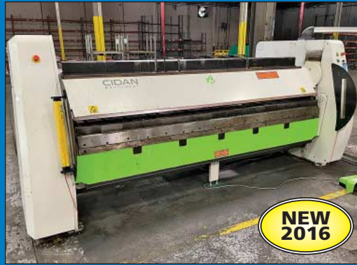
122" x 11 Ga. Cidan Futura Plus CNC Folder