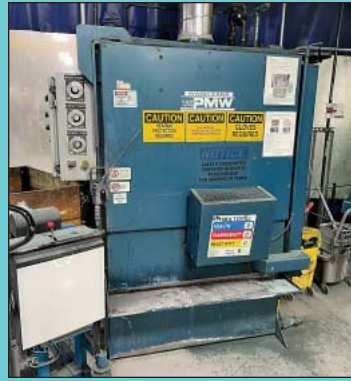
PMW Model 612 HD Parts Washer