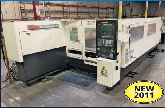
4,400 Watt Mazak HyperGear-510 CNC C02 Laser