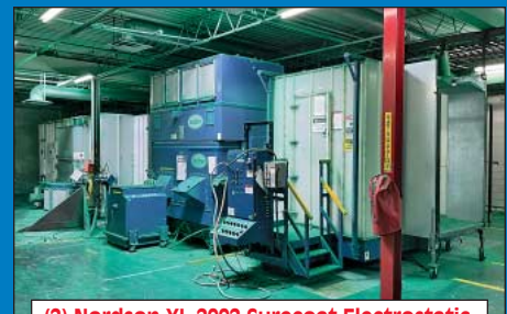
(2) Nordson XL-2002 Surecoat Electrostatic Powder Coating Paint Booths

CINCINNATI INDUSTRIAL AUCTIONEERS auctioneers | appraisers | since 1961