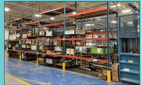
Large Quantity Adjustable Beam Pallet Rack